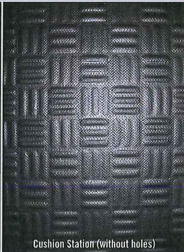
Cushion Station (without holes)

Cushion Station anti-fatigue mats feature nitrile-blended foam designed to withstand grease, oil, and chemicals. They are anti-microbially treated to prevent odors and available with or without holes for use in wet or dry areas.